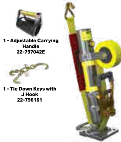
1 - Adjustable Carrying Handle 22-797042E