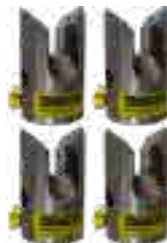
4 - Multi-Base 22-796025