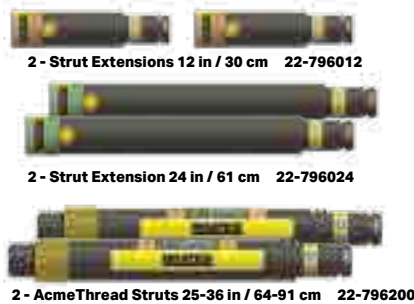
2 - Strut Extensions 12 in / 30 cm 22-796012