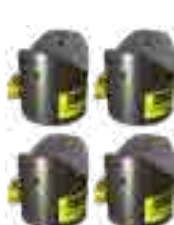
4 - V Base 22-796090