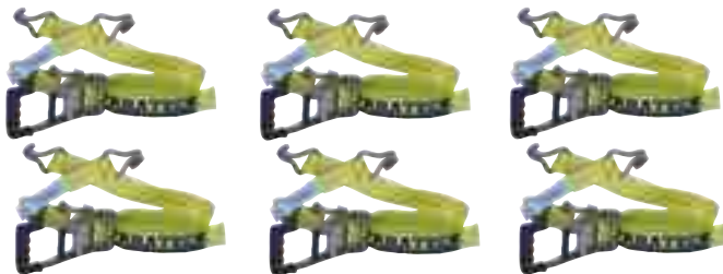
6 - Ratchet Belt with Finger Hook 27 ft / 8.2 m 22-890553