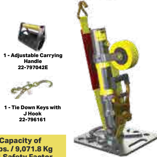
1 - Adjustable Carrying Handle 22-797042E