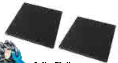
2 - Non Slip Neoprene Pad 22-890015