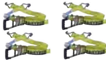
4 - Ratchet Belt with Finger Hook 27 ft / 8.2 m 22-890553