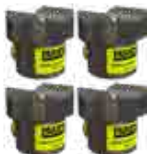
4 - Contour Base 22-796270