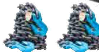
2 - Chain 20 ft / 6.1 m x 3/8 in, grade 100 22-796C1H