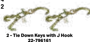
2 - Tie Down Keys with J Hook 22-796161