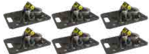
6 - Hinged Base with Anchor Ring 12 in / 30 cm 22-796180C