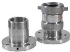
NH (National Hose)