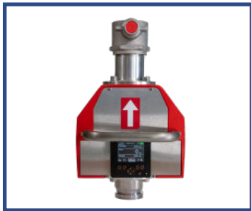
Lightweight & Portable