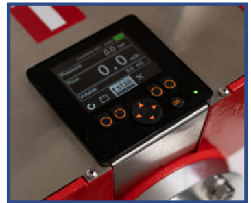
Simple Readout Display