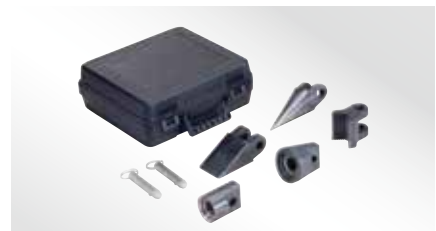
Ram attachment set for rescue rams, to increase variety of applications