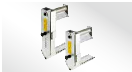
Patented ram support LRS-C