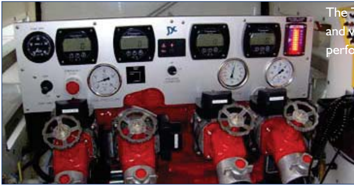
GMFRS Fire Service Year 2008 fire appliance pump bay.

The TSI Flowmeter is of electromagnetic type and was designed specifically for use in the robust environment that is a pumping appliance. With no moving parts and nothing projecting into the flow channel the TSI flowmeter has unrivalled robustness and reliability. Sensor dimensions match those of the pump and there is no pressure loss. In use at Greater Manchester Fire and Rescue Service since 1993, the TSI Flowmeter is fitted on all GMFRS pumping appliances.