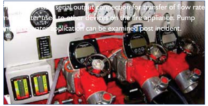
East Sussex Fire and Rescue Service Year 2007 fire appliance pump bay.

The TSI Flowmeter is of electromagnetic type and was designed specifically for use in the robust environment that is a pumping appliance. With no moving parts and nothing projecting into the flow channel the TSI flowmeter has unrivalled robustness and reliability. Sensor dimensions match those of the pump and there is no pressure loss. In use at Greater Manchester Fire and Rescue Service since 1993, the TSI Flowmeter is fitted on all GMFRS pumping appliances.