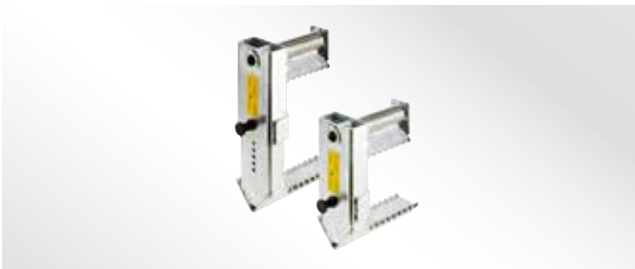
Patented ram support LRS-C