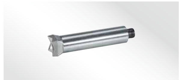
Extension 10 in./250 mm for R 410

Ram attachment set for rescue rams, to increase variety of applications Patented ram support LRS-C Patented ram support LRS 120