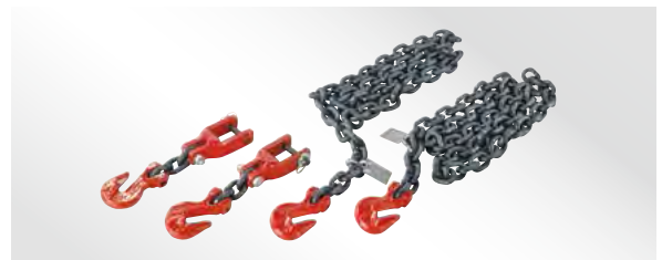
KSV 11 chain set